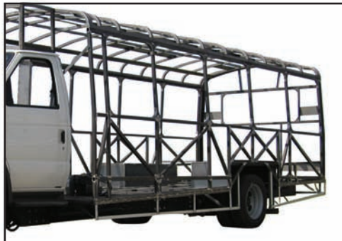
1½" x 1½" SteelGuard® construction provides superior durability.