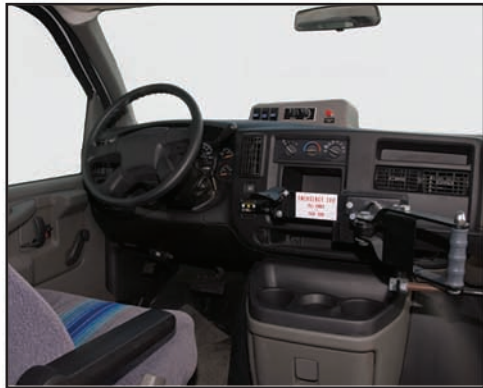
Convenient driver controls are easily accessible.