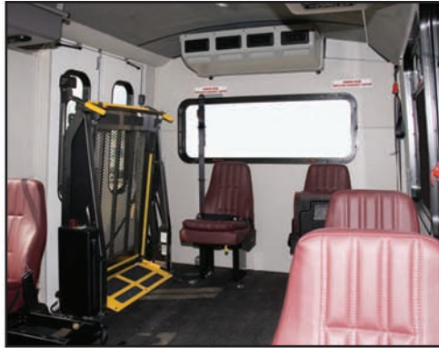
ADA packages available.